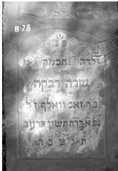
The year of death is probably