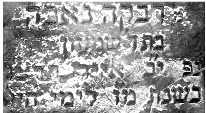
Figure 4 – Tombstone of Rywka Necha bat Szymon, deceased on (hard to read) 12 Iyar 5693 at age 46. No surname available.

• The Book of Permanent Residents (KLS) for the Halperin/Szmulewicz family: House #10, pp. 261–289, and