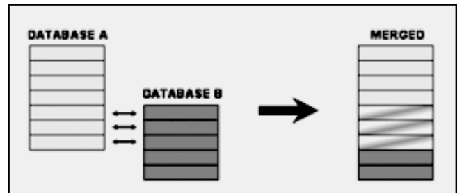
Figure 1 —Integration of information contained in databases A and B. The merged database includes overlapping and non-overlapping information, thus increasing the useful amount of data for an individual.

names, ages and occupations of the parents; death records, on the other hand, usually include age at death and often identify surviving family members. The merging of these two databases obviously increases the amount of genealogical information for a given individual and his/her family. The main problem, of course, is to ensure that the merging procedure links identical individuals, namely that the birth and death documents of Jacob Goldberg, for example, are those of the same Jacob Goldberg. In other words, merging criteria of "identicalness" must be defined as accurately as possible. (Figure 1)